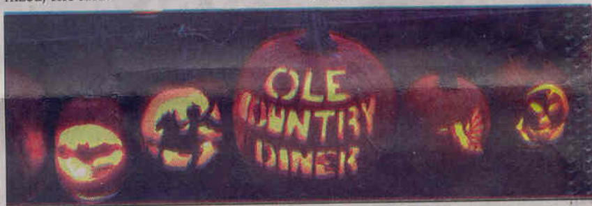
GLENN OGIVLE The Observer

"Unfortunately, some kids won't be able to go out for Halloween, so it's nice that people are thinking of them at this time."